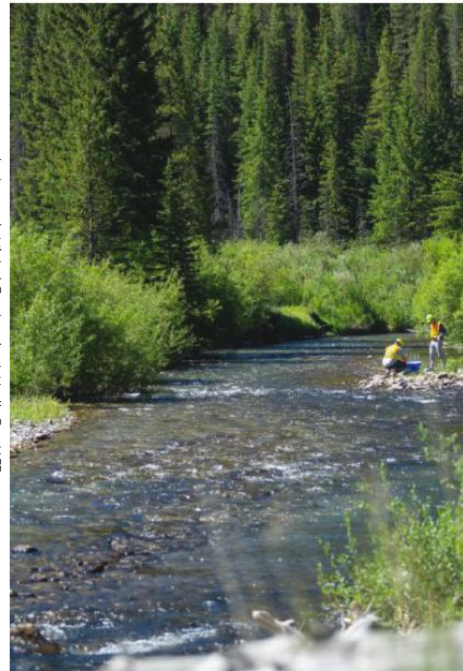
(unknown). Michel Coal project. North Coal LTD.